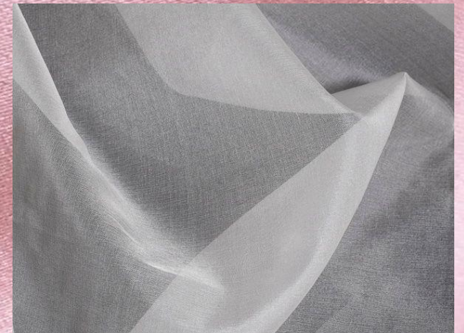
Organza Silk 15 gram / 22 gram / 28 gram / 37 gram Organza Silk Satin- 48 gram