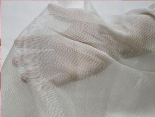
Chinon Chiffon Silk Fabric- 37 gram Diamond Chiffon Silk Fabric- 32 gram Platinum Chiffon Silk Fabric- 40 gram