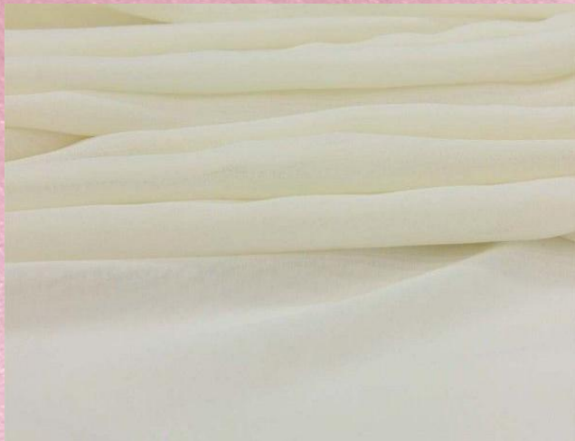
Georgette Silk Fabric 40 gram/60 gram/80 gram