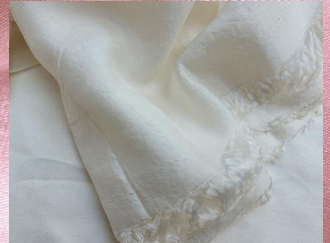
Crepe de Chine Silk Fabric 60 gram / 80 gram