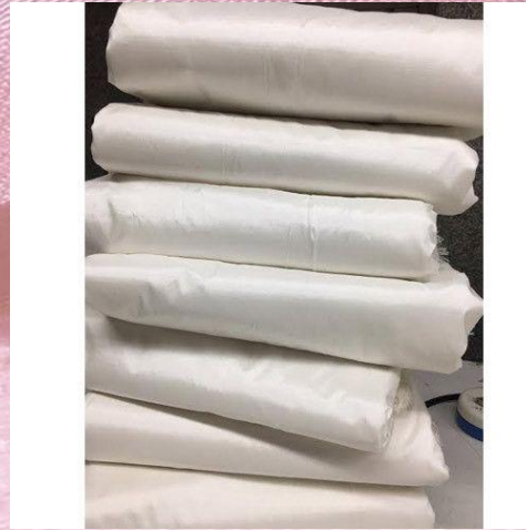
Handloom Mulberry Silk Fabric 45 gram / 55 gram