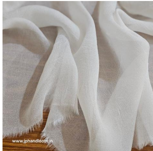
JP/T- (GSM: 60 ) Bamboo Silk Georgette Fabric Usage: Womens Wear