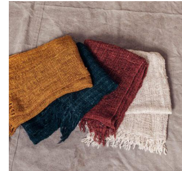
JP/T-1766(A) ( GSM: 275 ) Hemp Dyed Handloom Fabric End Use: Bags, Rugs, Craft