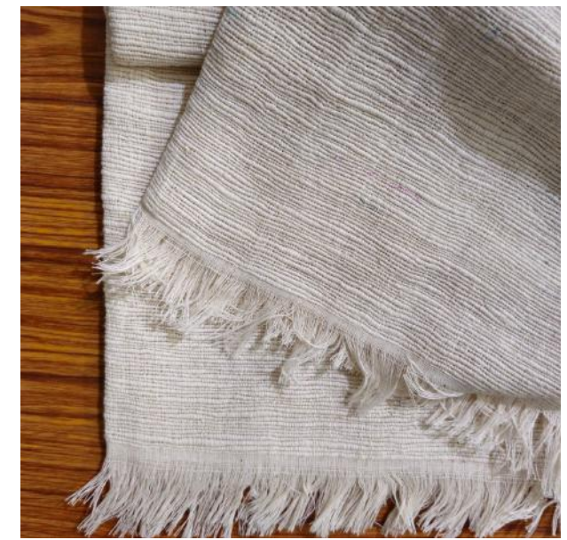
JP/T-1766 ( GSM: 325 ) Hemp White Handloom Fabric End Use: Bags, Rugs, Craft, Jacket