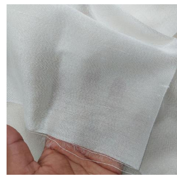
JP/T-1490 (GSM: 110) Silk Bamboo Handloom Fabric End Use: Shirts, Womens Wear