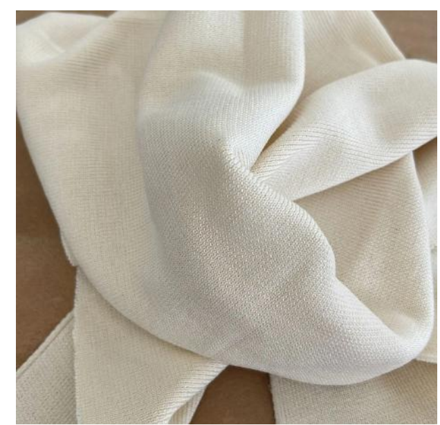
JP/T-1355(A)-( GSM: 240 ) 100% Bamboo Knitted Fabric Usage: Womens Wear