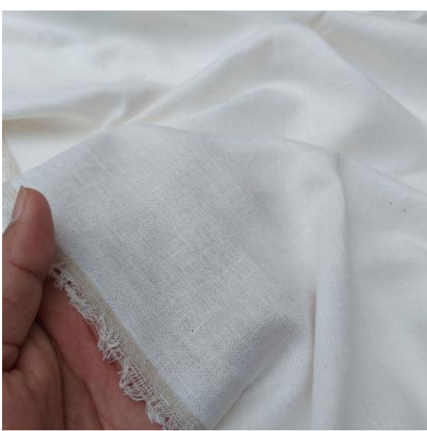
JP/T-1412 (GSM: 100) 100% Bamboo Handloom Fabric End Use: Shirts, Womens Wear