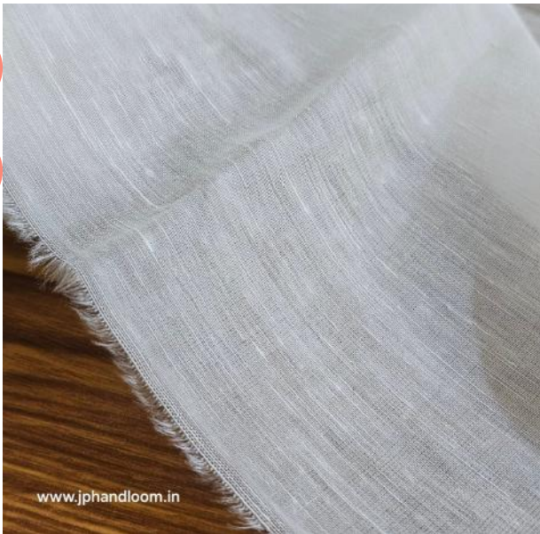
JP/T-1684 (GSM: 85) Bamboo Linen Handloom Fabric End Use: Womens Wear