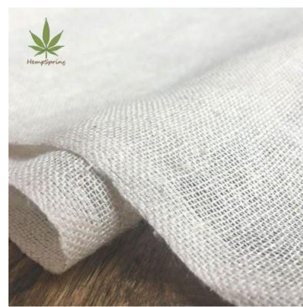
JP/T- (GSM: 85) 100% Hemp Gauze Fabric End Use: Shirts, Womens Wear