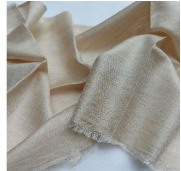
JP/T-1573-( GSM: 80 ) Bamboo Tussar Silk Blended Fabric Usage: Womens Wear