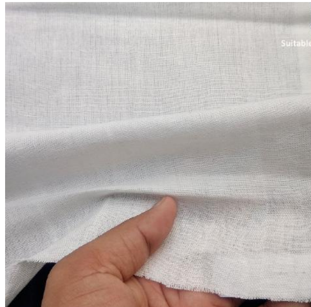
JP/T-1174( GSM: 165 ) Hemp Bamboo ECRU Handloom Fabric