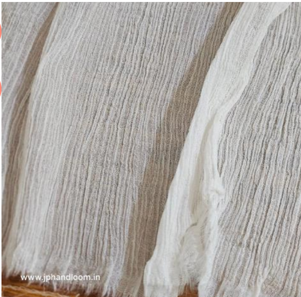
JP/T- (GSM: 50 ) Bamboo Silk Chiffon Fabric Usage: Womens Wear