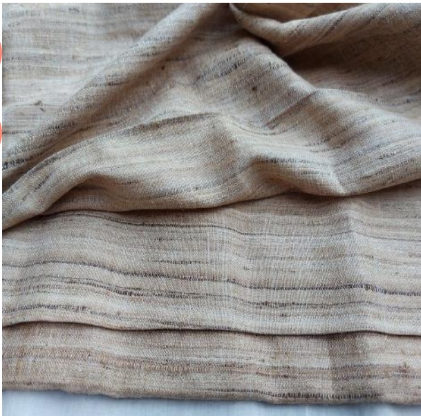
JP/T-1408 ( GSM: 125 ) Hemp& Tussar Silk Natural Handloom Fabric