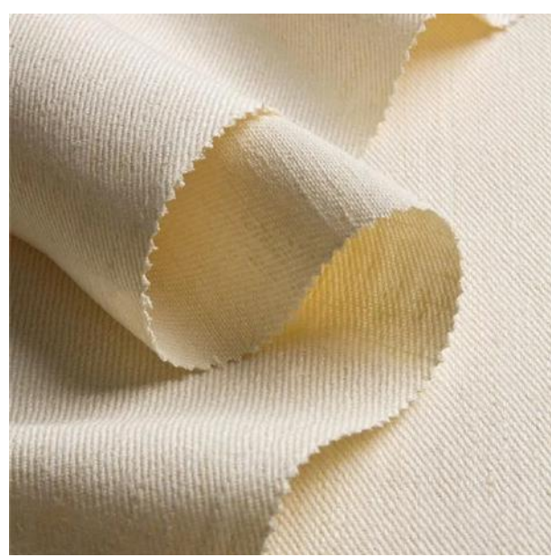
JP/T-1769 ( GSM: 170 ) Hemp ECRU TWILL Handloom Fabric End Use: Trousers, Garments