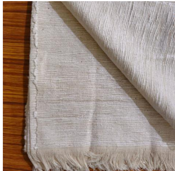
JP/T-1767 ( GSM: 310 ) Bamboo White Handloom Fabric End Use: Bags, Rugs, Craft