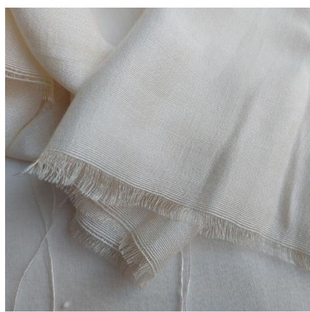
JP/T-1272 (GSM: 140 ) Silk & Bamboo Blended Fabric Usage: Garments, Shirts, Trousers