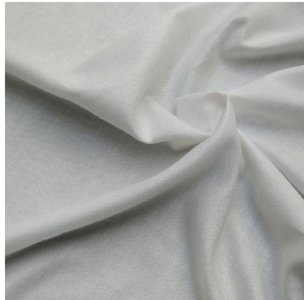
JP/T-1177 (GSM: 130) 100% Bamboo Fabric End Use: Shirts, Womens Wear