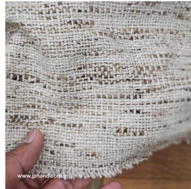
JP/T-1435 ( GSM: 450 ) Hemp & Silk Handloom Fabric End Use: Bags, Rugs, Craft