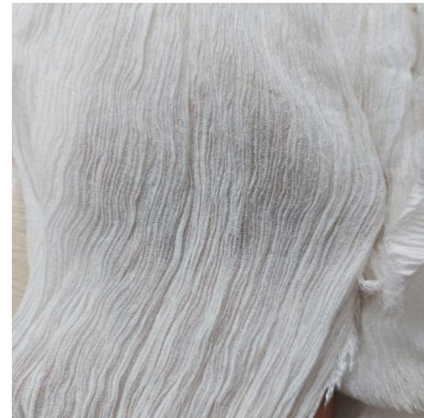
JP/T-1276-( GSM: 80 ) Bamboo Silk Wrinkle Fabric Usage: Womens Wear