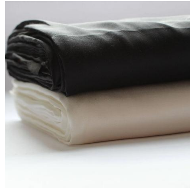
JP/T-1175 (GSM: 215) 100% Bamboo Fabric End Use: Shirts, Trousers