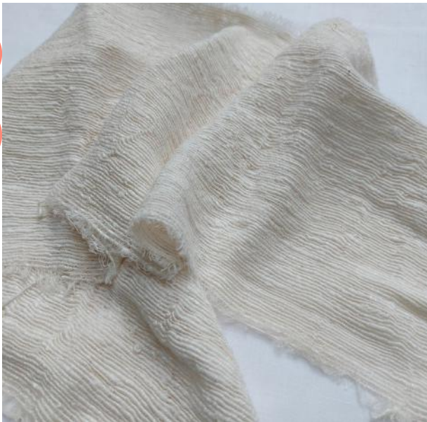
JP/T-1767(A) ( GSM: 375 ) Bamboo Katiya Handloom Fabric Usage: Bags, Rugs, Craft