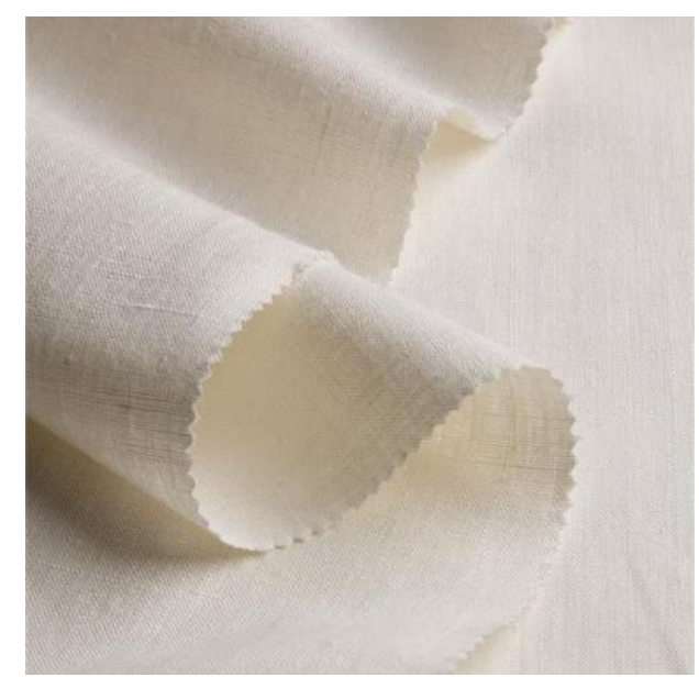
JP/T-1771 ( GSM: 140 ) Hemp ECRU Handloom Fabric End Use: Shirts, Trousers