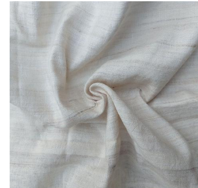
JP/T-1405( GSM: 125) Hemp & Eri Silk Handloom Fabric End Use: Shirts, Lamp Shade