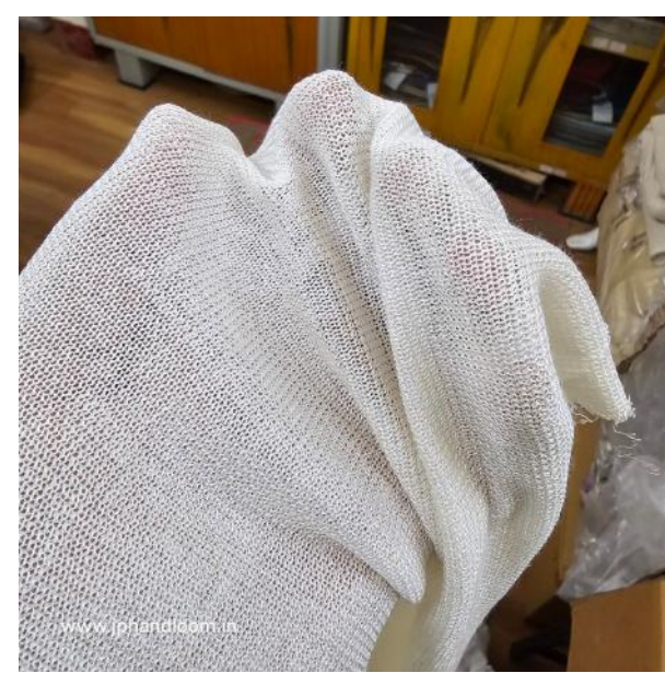
JP/T-1355 (GSM: 140 ) 100% Bamboo Knitted Fabric Usage: Womens Wear