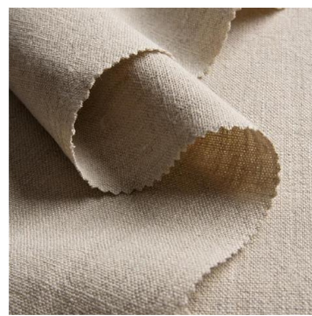
JP/T-1770( GSM: 150 ) Hemp Natural Handloom Fabric End Use: Garments, Trousers