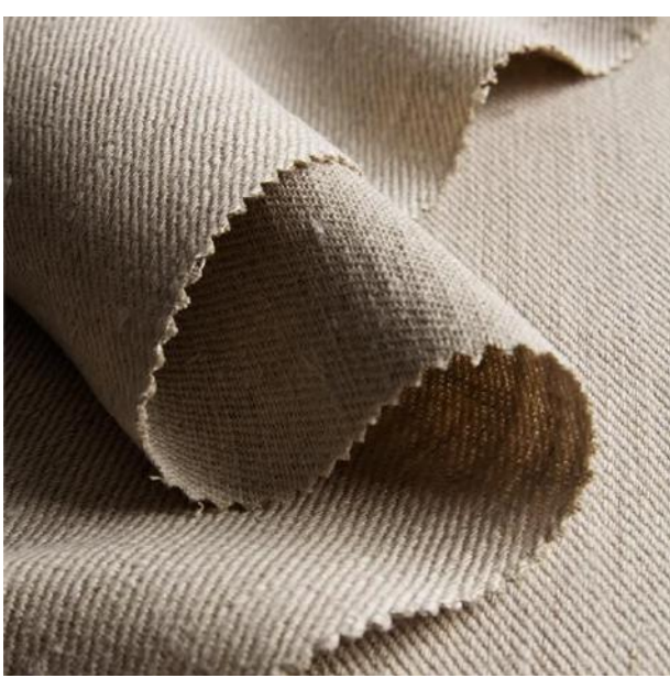
JP/T-1768 ( GSM: 200 ) Hemp Natural Twill Fabric End Use: Bags, Jackets, Trousers