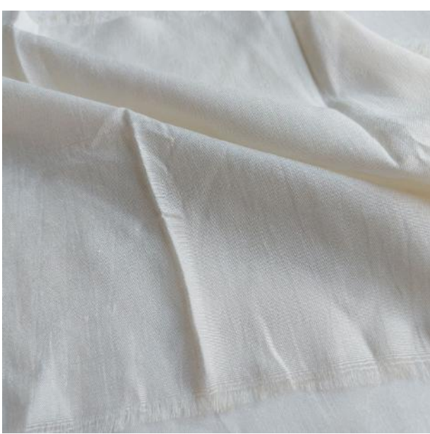
JP/T-1271 (GSM: 120 ) Silk & Bamboo Blended Fabric Usage: Garments, Shirts