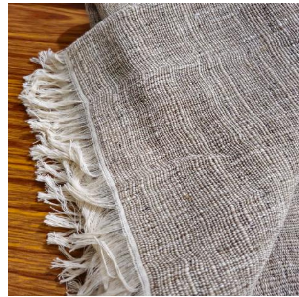
JP/T-1756 ( GSM: 410 ) Hemp Natural Handloom Fabric End Use: Bags, Rugs, Craft