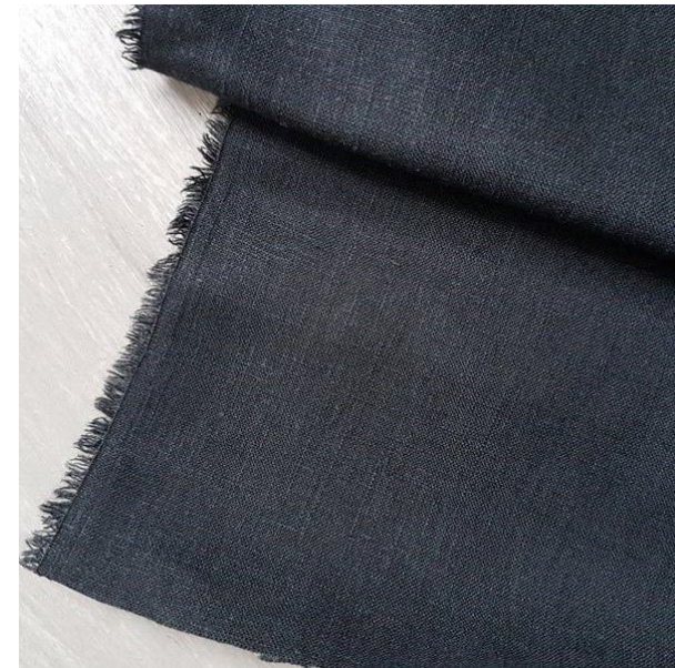
JP/T-1771-Dye ( GSM: 135 ) Hemp Black Dyed Fabric End Use: Shirts, Trousers