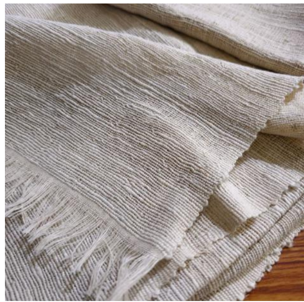
JP/T-1765 ( GSM: 340 ) Nettle White Handloom Fabric Usages: Bags, Rugs, Craft, Jacket