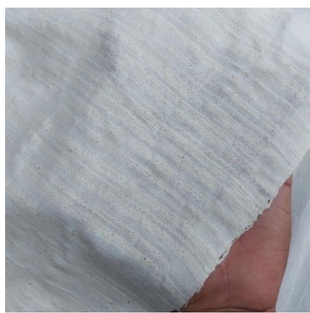
JP/T-1409 (GSM: 125) Hemp & Cotton Handloom Fabric End Use: Shirts, Pants