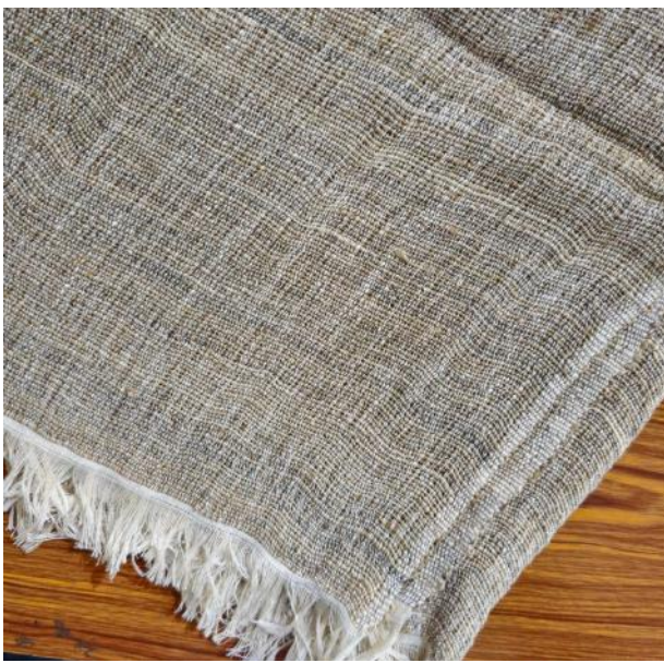
JP/T-1757 ( GSM: 410 ) Nettle Natural Handloom Fabric End Use: Bags, Rugs, Craft